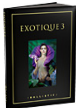
Special Edition 1MB .png