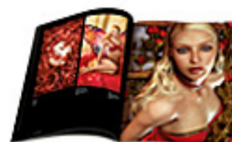
Book Spread 6MB .zip