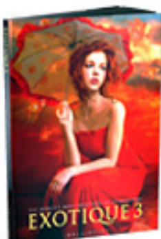
Soft Cover 1MB .png